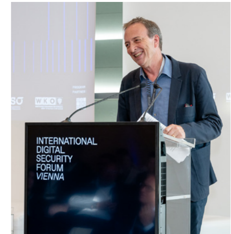
Misha Glenny, Rector of the Institute for Human Sciences (IWM) in Austria

The first day of the conference ended with the panel on “Trustworthy and Socially Responsible AI”. The topics ranged from information integrity and bias avoidance to ensuring the transparency of AI algorithms, and the need for broad public education and combating disinformation through AI in the news world. Traceability and explainability of AI-supported system processes are vital if we are to improve trust in machines and our understanding of AI.