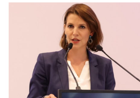
Karoline Edtstadler, Federal Minister for the EU and Constitution at the Federal Chancellery of Austria

The panel that concluded the morning was entitled "Bridging the Gap: Strategies for Global Collaboration between Security, Standardisation and Policy Making Communities" and dealt with strategies for interlinking these building blocks. The discussion ranged from the automotive industry, where product approvals are already linked to regulatory requirements, to the cybersecurity certification of products and IoT systems, and the importance of security by design in developing resilient systems. The session also referred to the NIS2 Directive and highlighted its relevance for establishing cybersecurity standards.