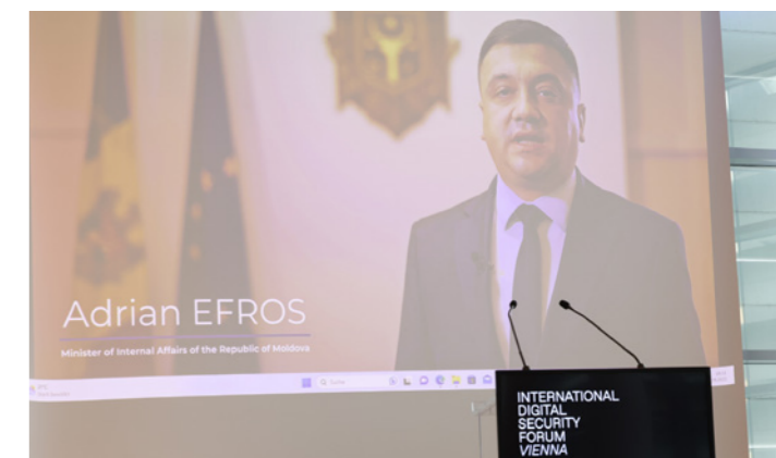
Adrian Efros, Minister of Interior of the Republic of Moldova

The final keynote of the conference by Senadin Alisic, Strategy Advisor at Combitech AB, Sweden, titled "Unlocking and Protecting Value: Transforming Industrial Ecosystems and Smart Cities with Cybersecurity Vigilance", emphasised the importance of the emerging data economy, which will fundamentally change existing business models. He presented three impressive data space examples in the areas of smart cities, sustainable mining, and highly effective port logistics operations.